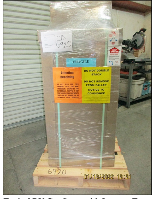
Typical Pellet or Wood Stove Packing